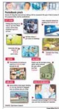
Pocketbook Pinch: Dozens of rising fees and costs are taking a toll on consumers.